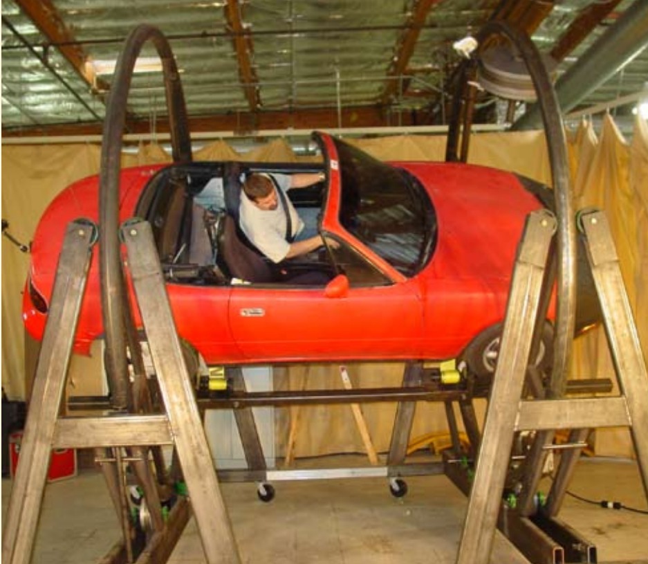
Miata quasi-static roll spit test