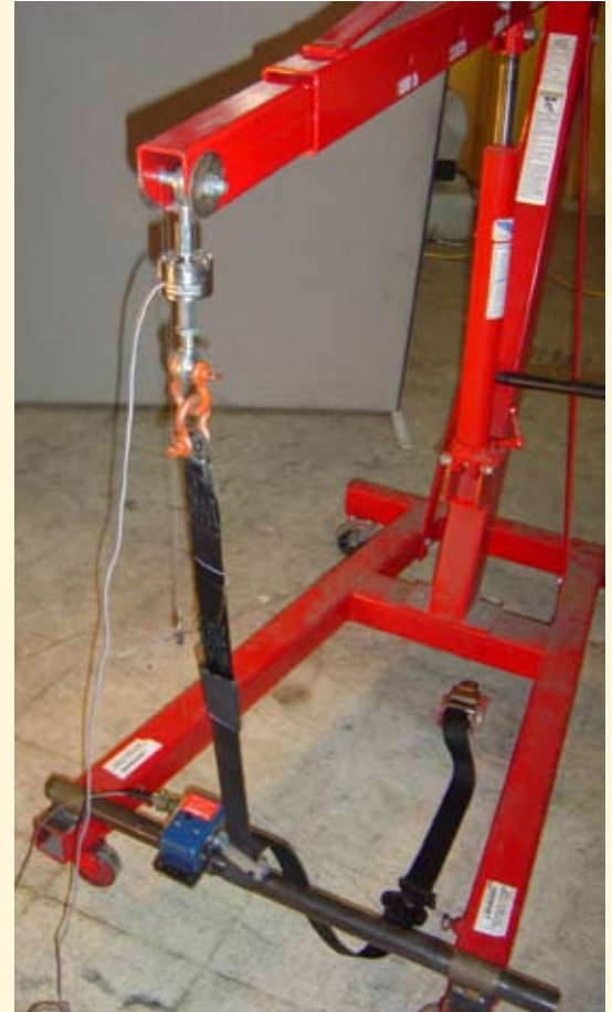
Miata “rip stitching” seat belt pull test

The pre-suit investigation uncovered a strikingly similar case in San Antonio, Texas that involved a 1992 Miata. Although that case resulted in a defense verdict, it was used to show that Mazda had notice of the danger its “rip stitching” seat belt posed during far side collisions. Discovery then revealed that the driver’s seat belts in Miatas manufactured for sale in Japan, Canada and a number of European countries did not use “rip stitching.” Building on this information, plaintiffs’ biomechanical and seat belt design experts performed a series of roll spit tests to compare the performance of the “rip stitching” U.S. seat belt with the seat belt used in other Miatas. The results showed the “rip stitching” caused at least four to six extra inches of lateral head excursion in a quasi-static environment. With the testing as foundation, plaintiffs’ biomechanical expert was prepared to testify that had Tim Richards Miata been equipped with a seat belt without “rip stitching,” like Miatas sold in Japan, Tim’s head would not have reached the passenger door structure and his devastating injuries would have been prevented.